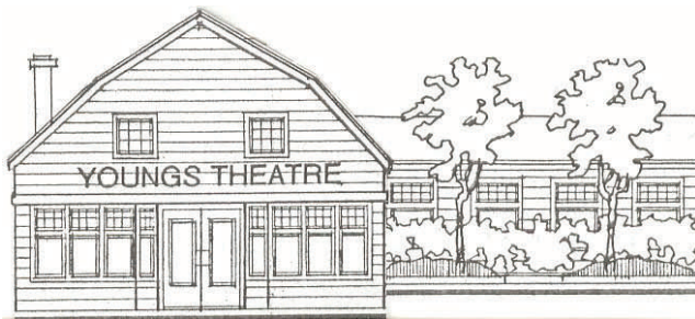
Conceptual Drawing of Young's Theatre

The Monticello Community Foundation is a non-profit, 501(C)3 organization dedicated to cooperative, locally driven, non-sectarian community improvement and development. The mission of the foundation is to foster cultural, civic, and economic development within the community of Monticello, Utah while preserving local character and history. The Monticello Community Foundation was established in 1992 and has been working quietly in the community since then. MCF has brought over $400,000 into Monticello in grant funds for various projects.