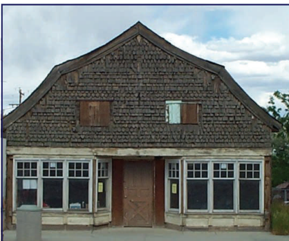
Young's Theatre is an ongoing restoration project that will bring this theatre back to life.

The Monticello Community Foundation P.O. Box 601, Monticello, UT 84535