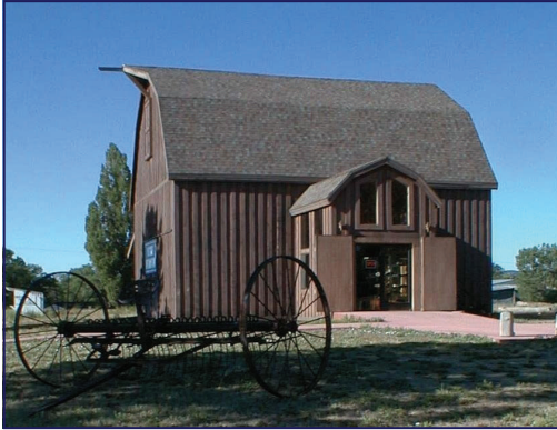
The Frontier Museum was moved from its former location and restored with funds acquired by the Monticello Foundation. It has been expanded and now houses the Southeast Utah Welcome Center at 232 South Main Street in Monticello.